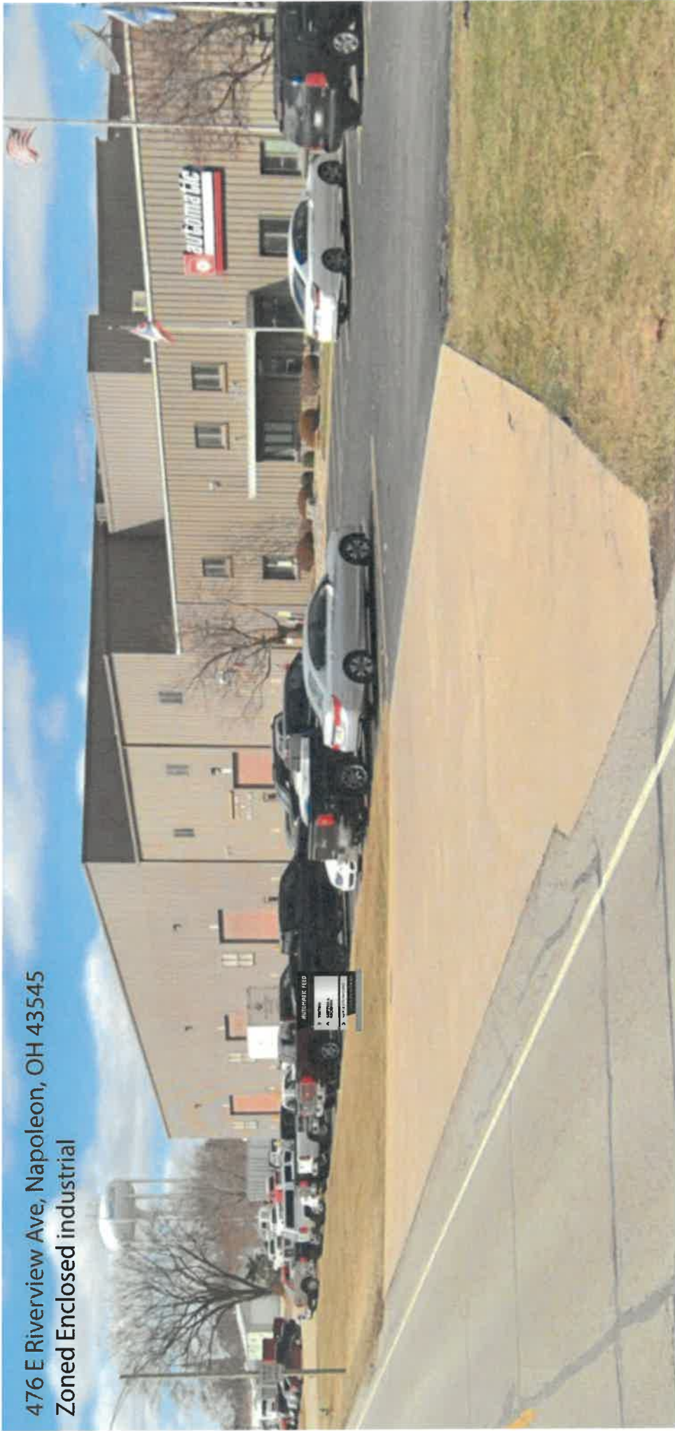
476 E Riverview Ave, Napoleon, OH 43545 Zoned Enclosed industrial